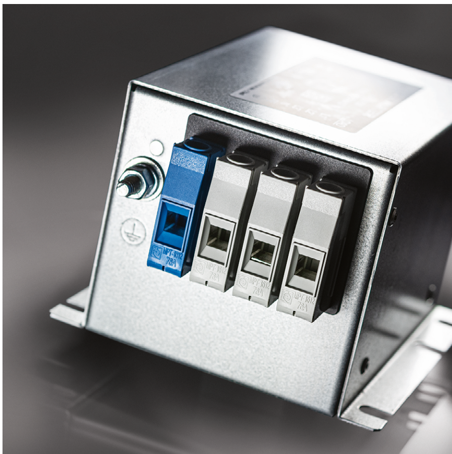
SCHURTER FMBD EP: 2-stage 3-phase filter with neutral conductor

If a machine is plugged into the mains, the touchable voltage at the plug pins must be max. 60 V after 1 second. For machines permanently connected to the mains, a discharge time of 5 seconds is sufficient. To comply with the EMC limits, filters with many large capacitors between the phases are often used. These allow a large attenuation of the interference voltage. The problem is that these capacitors store a lot of energy, which is still present when they are disconnected from the mains. It is recommended to select filters with shorter discharge times. In this case, the discharge time of the capacitors is shortened by using leakage