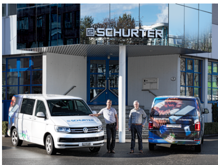
SCHURTER offers mobile EMC measuring systems

is that a disconnecting device must be provided to prevent unexpected start-up. In the event of a mechanical hazard, it is mandatory to provide an emergency stop (chapter 10).